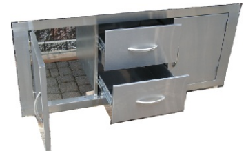
Dual Door & Drawers