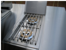
Dual Side Burners